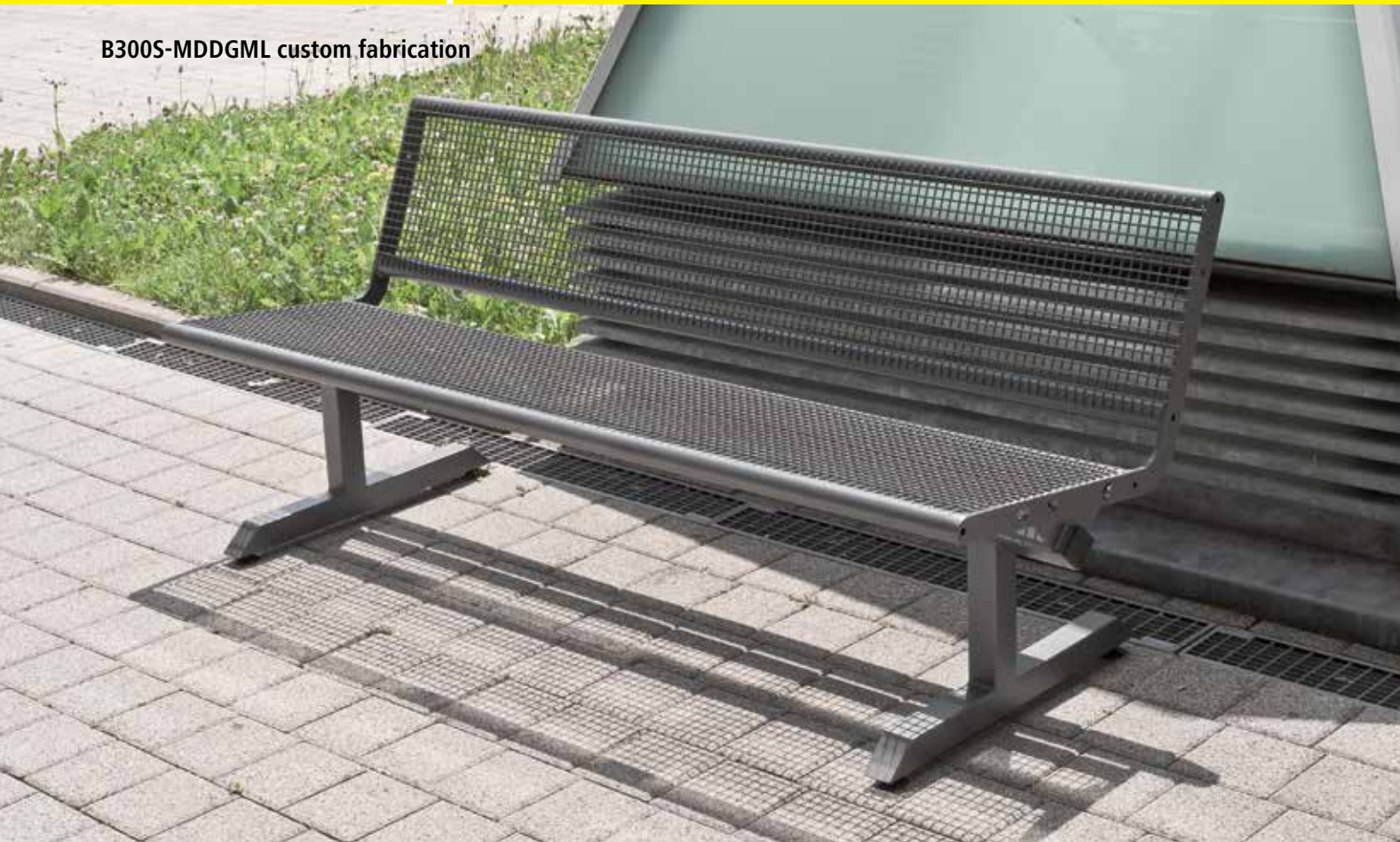
B300S-MDDGML custom fabrication