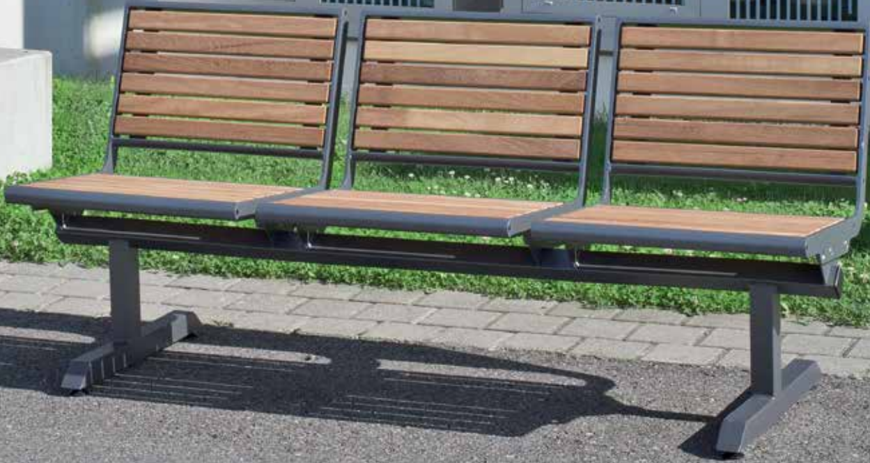
B300S-MEHOML Custom fabrication