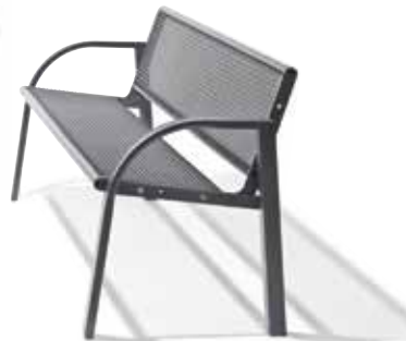
B520S-MDGML Custom fabrication