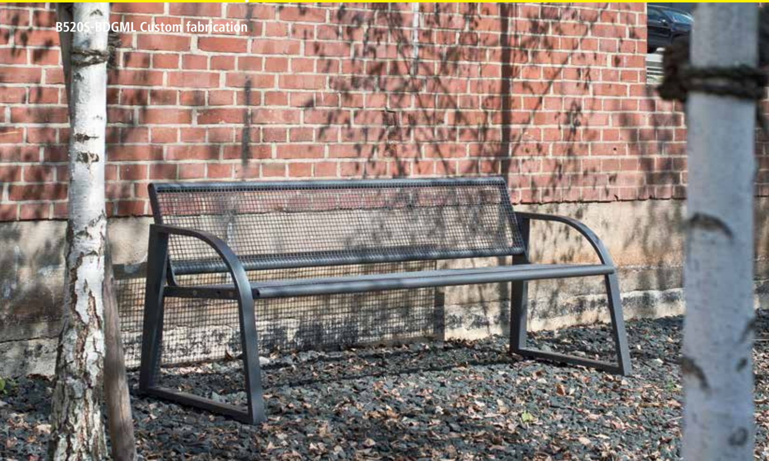
B520S-BDGML Custom fabrication