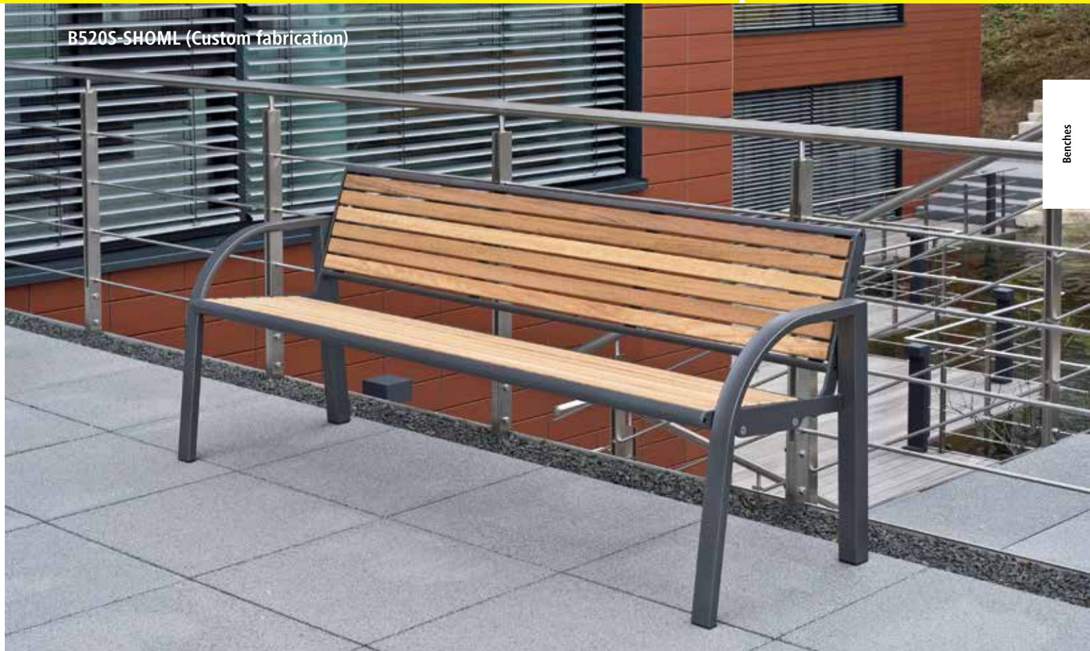
B520S-SHOML (Custom fabrication)