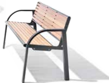
B520V-SHOML Custom fabrication