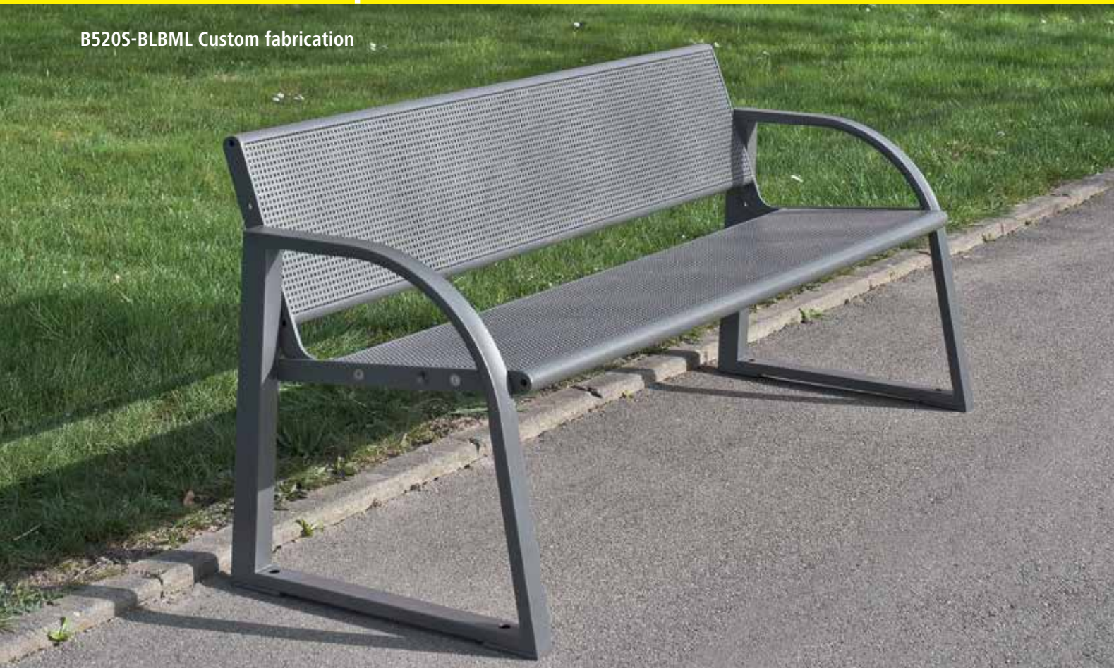
B520S-BLBML Custom fabrication