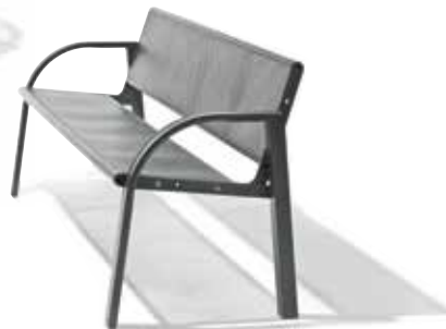
B520S-MLBML Custom fabrication