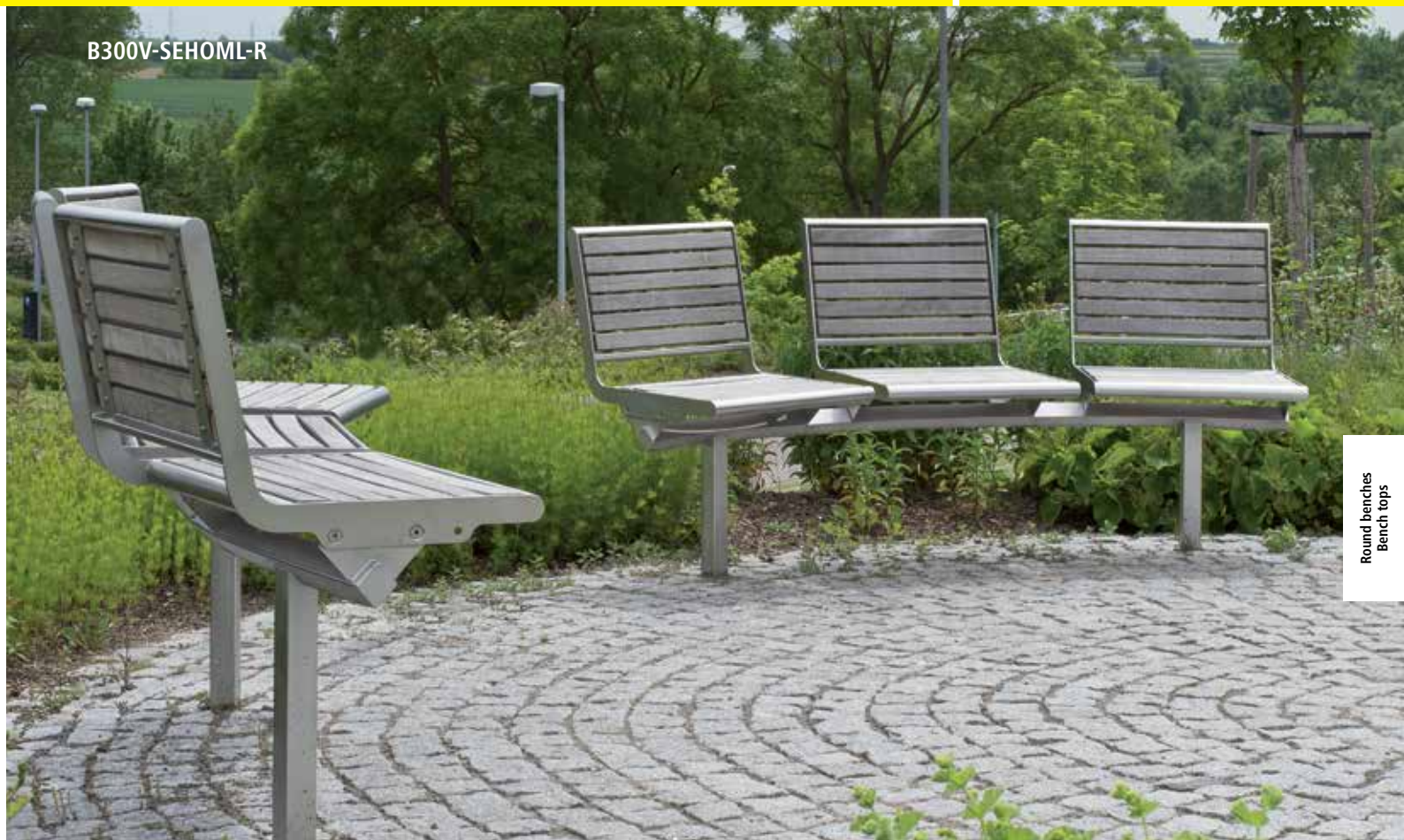
Round benches Bench tops