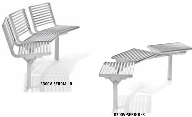
Round benches Bench tops