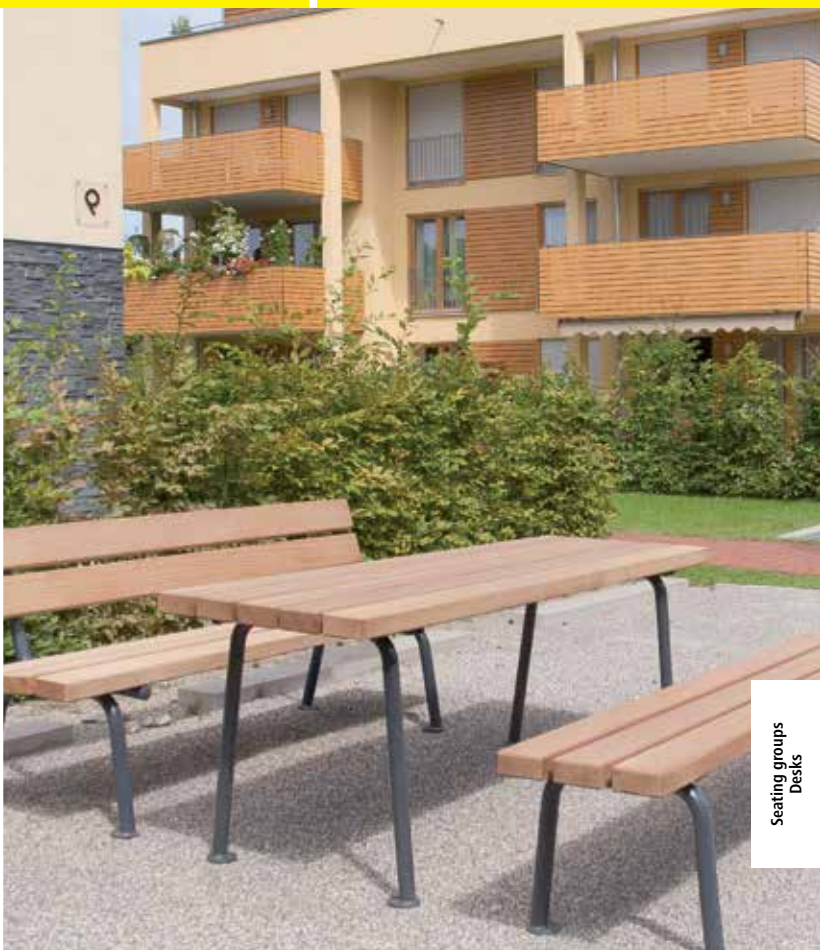
Seating groups Desks