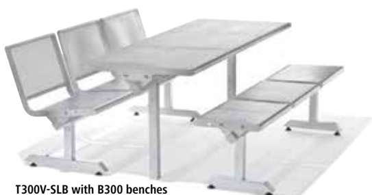
T300V-SLB with B300 benches