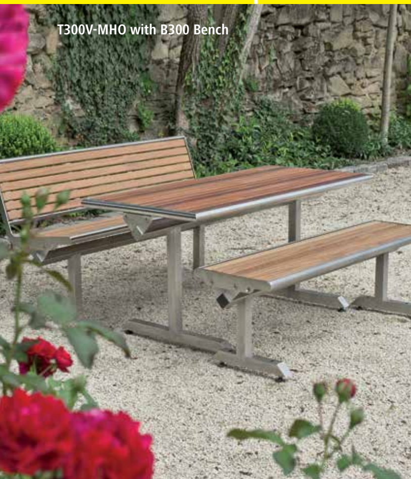
T300V-MHO with B300 Bench