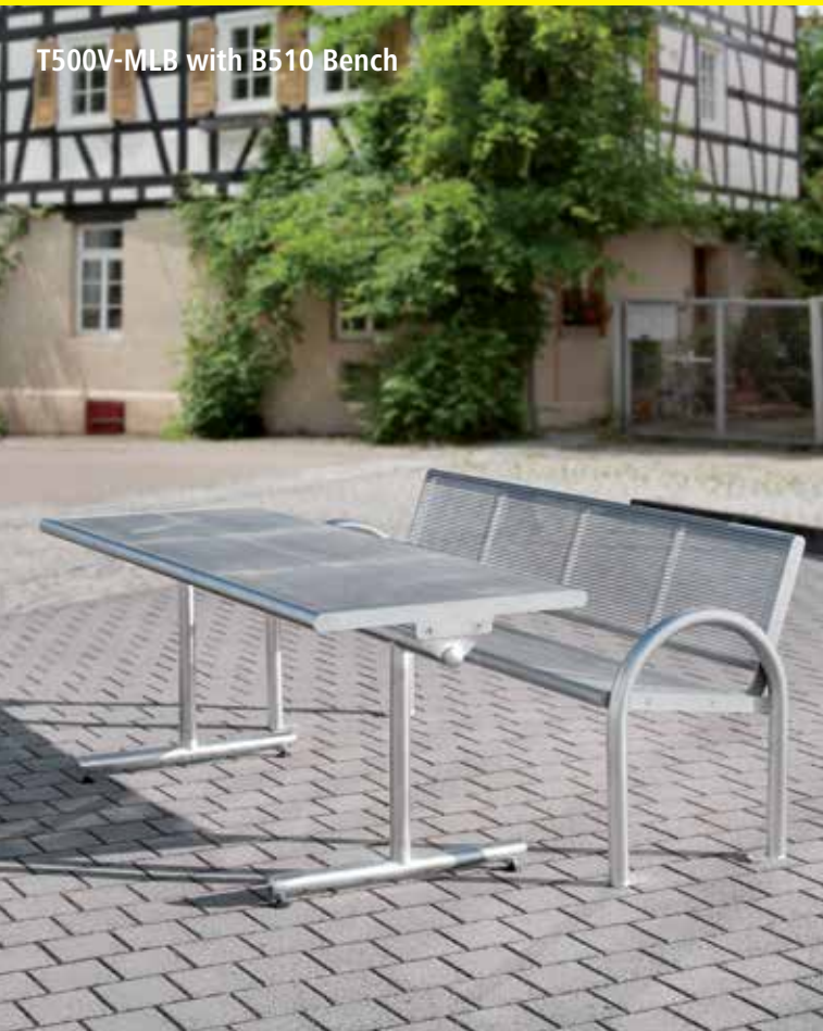
T500V-MLB with B510 Bench