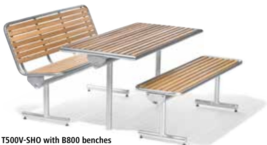
T500V-SHO with B800 benches