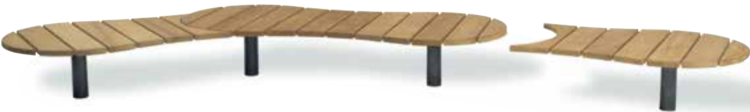
FIGURA expansion element